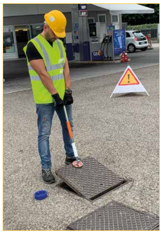
\begin{tabular}{ll} \textbf{Category 3 ATEX} & tools suitable for use in places classified ZONE 2. \end{tabular}

Ultra-light, ultra-compact manhole cover lifter, recommended for the safe lifting of gas network covers, petrol stations, petrochemical plants, docks, in potentially explosive situations.