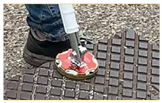
Spark-proof metal base.